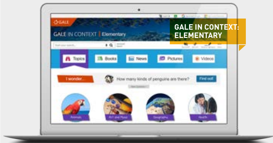
Product screen capture as of February 2021. Actual interface may vary.