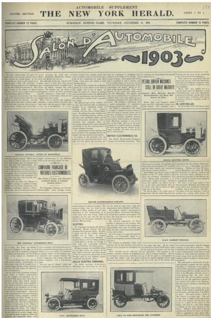
"Salon d'Automobile 1903", The New York Herald, European Edition, December 10 1903