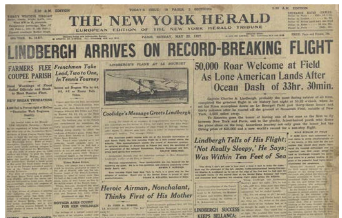
"Lindbergh Arrive on Record Breaking Flight", The New York Herald, European Edition, May 22 1927