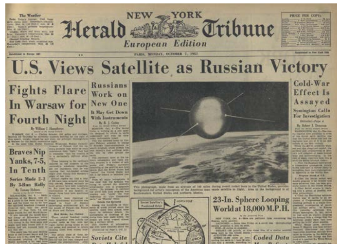
"U.S. Views Satellite as Russian Victory", New York Herald Tribune European Edition, October 7 1957