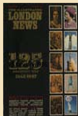
13 May 1967