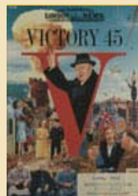
5 June 1995