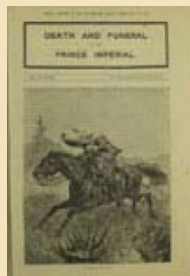
16 July, 1879