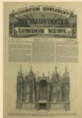
11 October, 1851