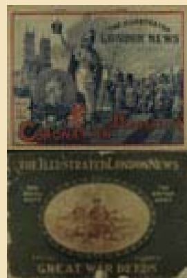
14 August 1902 22 March 1915