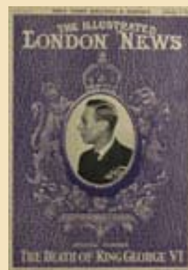
16 February 1952