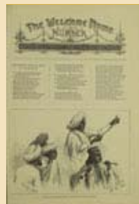
16 May, 1876