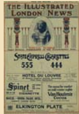
3 February 1923