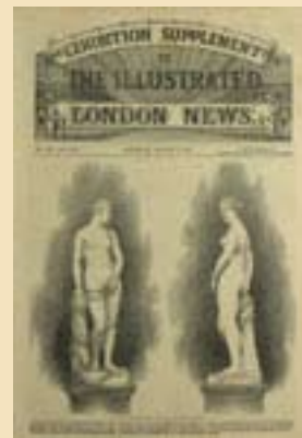
9 August, 1851