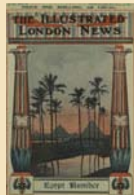
24 February 1923