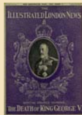
25 January 1936