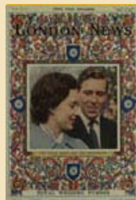
14 May 1960