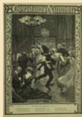
1 December, 1884