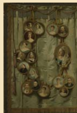
21 June 1897