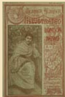
16 June 1890