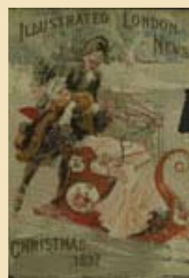
22 November 1897