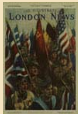
12 May 1945