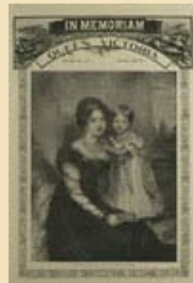
30 January 1901