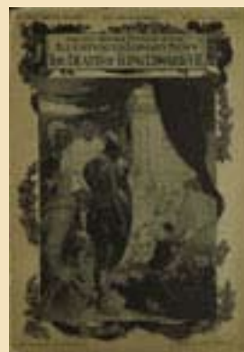
14 May 1910