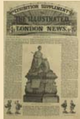
17 May, 1851