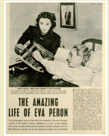
Deathbed of Eva Peron, 1952