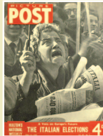
The Italian Elections, 1948