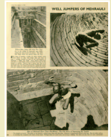
Well jumpers of Mehrauli, 1946