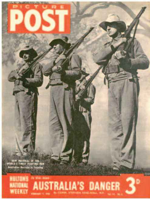
Australian recruits in training during WWII, 1942