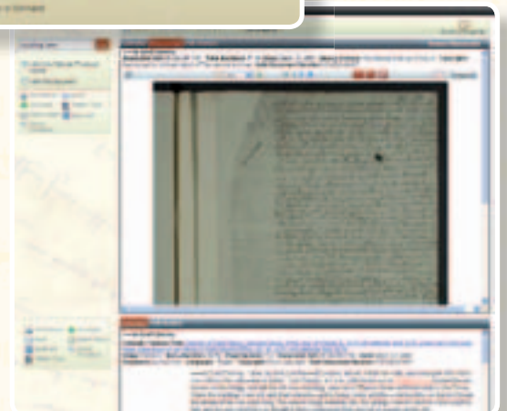
View manuscript image with Calendar entry