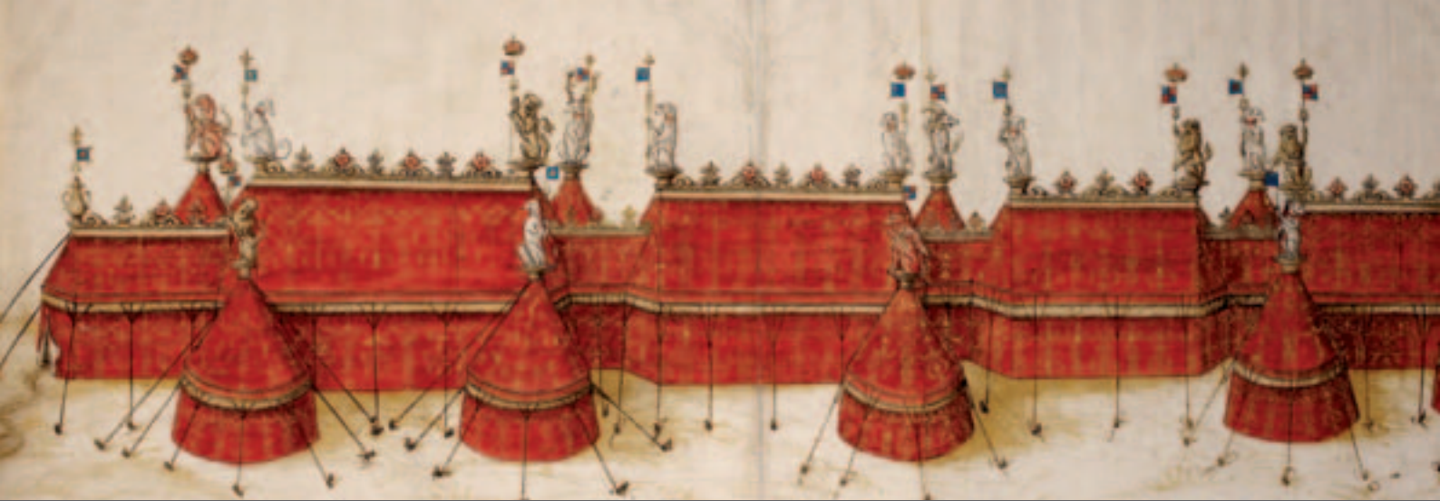
Field of the Cloth of Gold in 1520

State Papers Online is crucial for understanding the political, social, cultural, religious and economic landscape of the Tudor and Stuart periods, offering original historical manuscripts across the entire spectrum of domestic and foreign affairs. As such State Papers Online is a core resource for any student or researcher studying and publishing in Renaissance, Reformation, Restoration and Enlightenment studies. Institutions can purchase the series as a whole or order a part - or any combination of parts - in the series.