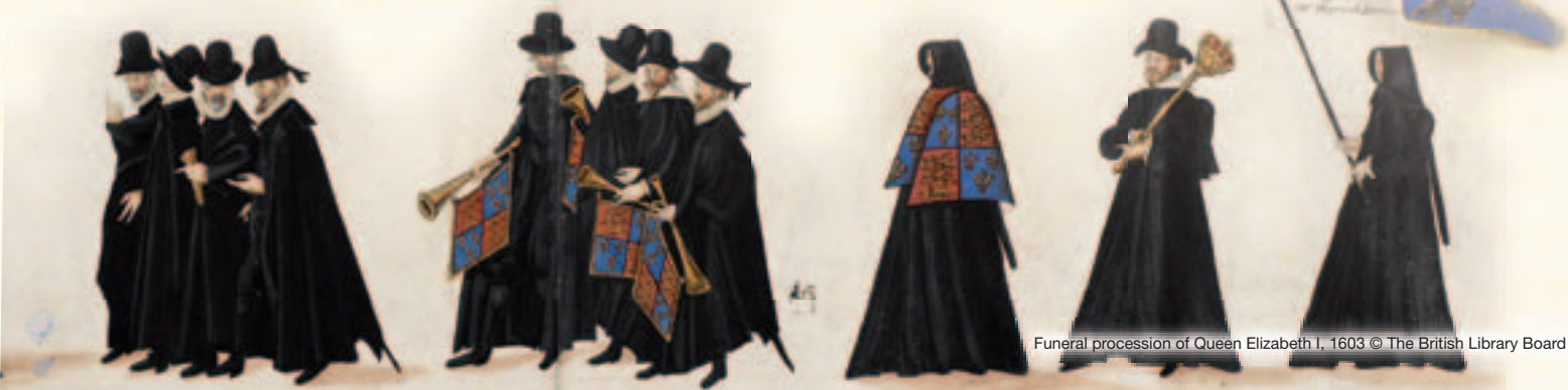
Funeral procession of Queen Elizabeth I, 1603

The National Archives, London: SP 46, 49, 50-53, 59-63, 65, 66, 68-71, 75, 77-85, 88, 89, 91, 92, 94-99, 101-106, 108, and PC 2 British Library: Selected documents from the Cotton, Harley and Yelverton Collections